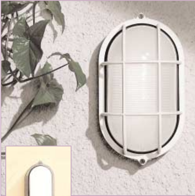
SHOWN IN WHITE WITH OPAL GLASS DIFFUSER