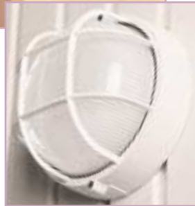
SHOWN IN WHITE WITH OPAL GLASS DIFFUSER

Rustproof, watertight wall mount luminaires of exquisite Italian design. Elegant matt finish in white or black. Indoor and outdoor applications; UL Listed for wet locations. Specified with glass or vandal-resistant polycarbonate lens allows applications that range from residential to docks and can include such areas as restaurants, hotels, condominiums, schools, hospitals, civic and government institutions. Some models will accept a self-ballasted fluorescent lamp.