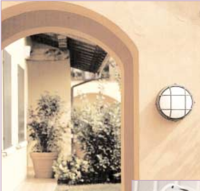
SHOWN IN BLACK WITH OPAL VANDAL RESISTANT POLYCARBONATE DIFFUSER