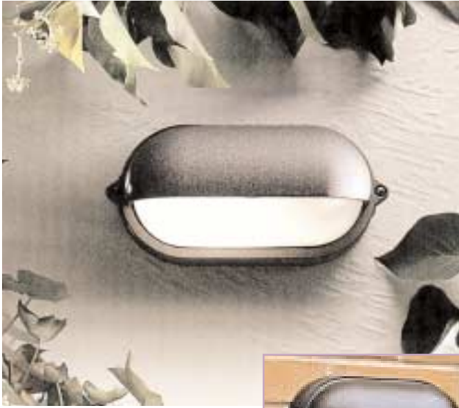
SHOWN IN BLACK WITH VANDAL RESISTANT OPAL POLYCARBONATE DIFFUSER