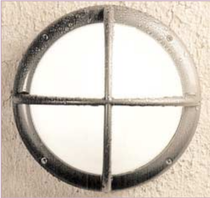
SHOWN IN ANTHRACITE WITH VANDAL RESISTANT POLYCARBONATE OPAL LENS