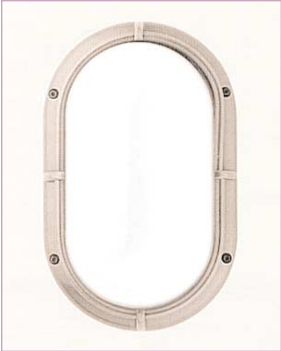
SHOWN IN ANTHRACITE WITH VANDAL RESISTANT OPAL POLYCARBONATE DIFFUSER

Exquisite Italian design. Premium, high-tech materials. Modern quality and construction. Manufactured to resist the ingress of dust and water due to its airtight seal even in the toughest conditions. Specified with the vandal resistant polycarbonate diffuser makes Kasko ideal for open access areas. Vertical or horizontal mount only on wall, bollard, or U-post.