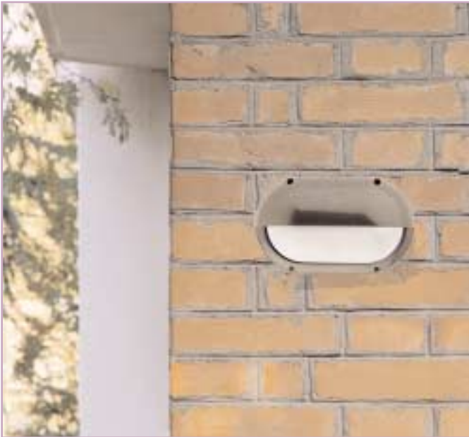
SHOWN IN ANTHRACITE WITH VANDAL RESISTANT OPAL POLYCARBONATE DIFFUSER

Exquisite Italian design. Premium, high-tech materials. Modern quality and construction. Manufactured to resist the ingress of dust and water due to its airtight seal even in the toughest conditions. Specified with the vandal resistant polycarbonate diffuser makes Kasko ideal for open access areas. Horizontal mount on wall, bollard, or U-post.