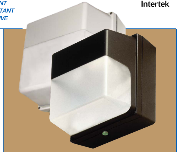
Non-emergency and emergency versions allow continuity of aesthetics in multiple luminaire installations.

Luminaire Type _____ Catalog Number _____ Product Code _____ Job Name _____ Approval _____