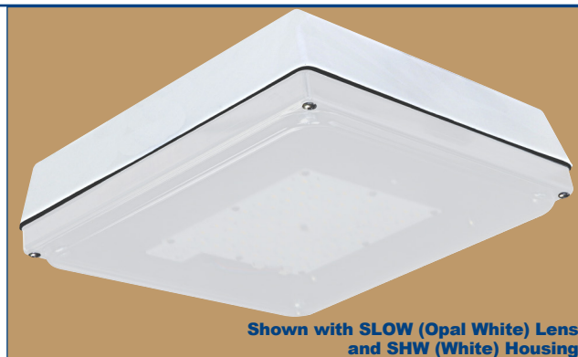
Shown with SLOW (Opal White) Lens and SHW (White) Housing

Up to 137,000 hours (25°C/77°F) = 13.6 years of 24/7 LED Life Calculations Based on US Department of Energy Worksheet DOE TM-21-11 70% Projection) Warranted for five (5) years.