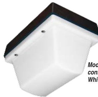
Model 300-LED in Standard configuration shown with Opal White Lens, Black Housing.

Hardware: Four (4) stainless steel 8-32x3/8 phillips truss head screws or tamperproof screws (must specify) attach lens to base plate. Mounting hardware included.