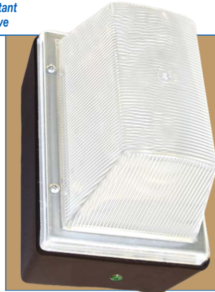
Model 300-LED shown in Emergency configuration.

Complies with FCC rules and regulations, as per Title 47 CFR Part 15 Non-Consumer (Class A) for EMI/RFI (conducted and radiated) at full load. Warranted for five (5) years.