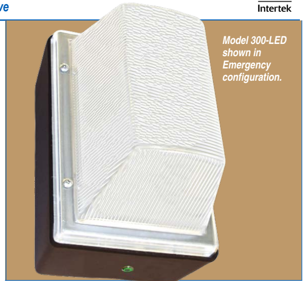
Model 300-LED shown in Emergency configuration.

Complies with FCC rules and regulations, as per Title 47 CFR Part 15 Non-Consumer (Class A) for EMI/RFI (conducted and radiated) at full load. Warranted for five (5) years.